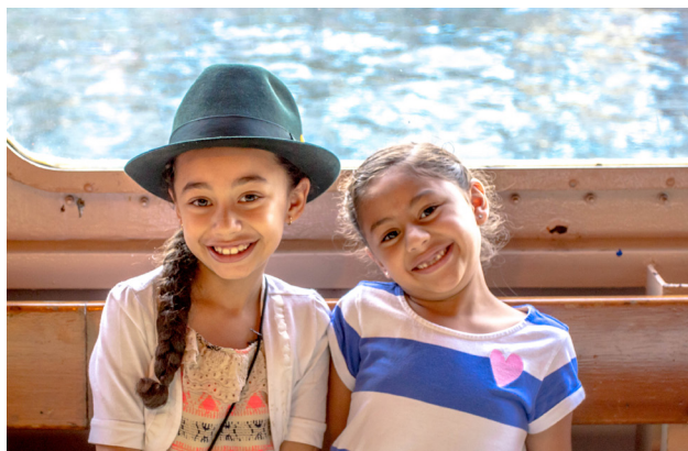
2019 Latinx Community Cruise