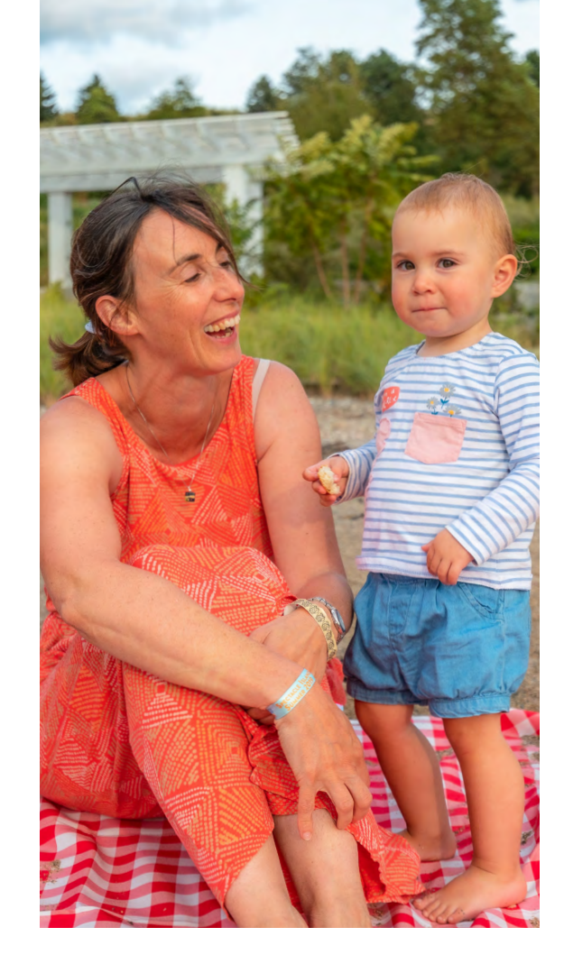
Start a monthly gift today, and help create new adventures all year long.

With your gift, Boston Harbor Now is working hard to make our harbor more welcoming, resilient, and accessible, so everyone can experience the joy and adventure that comes from a visit to the harbor, waterfront, and Islands.